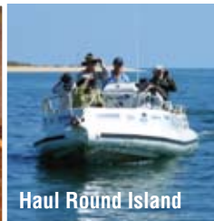
Haul Round Island