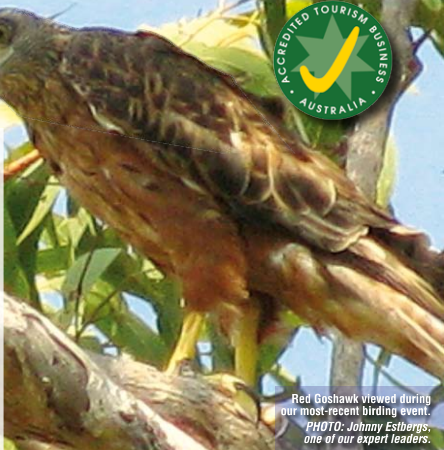
Red Goshawk viewed during our most-recent birding event.