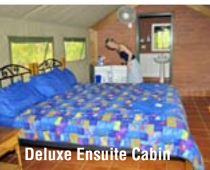
Deluxe Ensuite Cabin