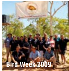
Bird Week 2009